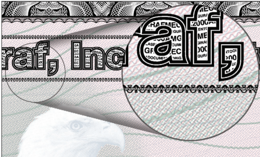
Detail Enlargement of a MECCA 2000 Created Security Document

MECCA 2000 contains a comprehensive set of design tools to add copy-resistant graphical safeguards to certificates, coupons, titles, tickets, monetary or legal documents, and other valuable forms, labels, and tags. Our fine-line relief backgrounds with microtext, phantom images, and guilloche patterns are easy to create and virtually impossible to duplicate. Copy protection "Void" pantograph technologies using public domain and proprietary methods are also available.